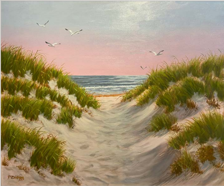
Peg Dittmar Summer Solstice Oil on canvas 28" x 24"