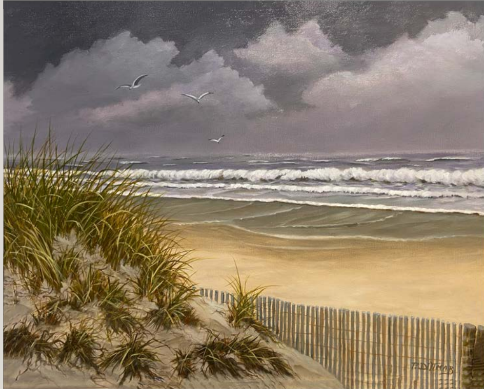
Peg Dittmar Storm Clouds In Avalon Oil on canvas "14 x 20"