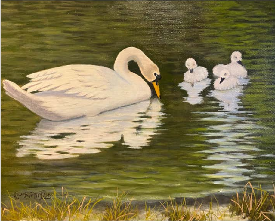
Peg Dittmar Swan with Cignets Oil on canvas 11" x 14"