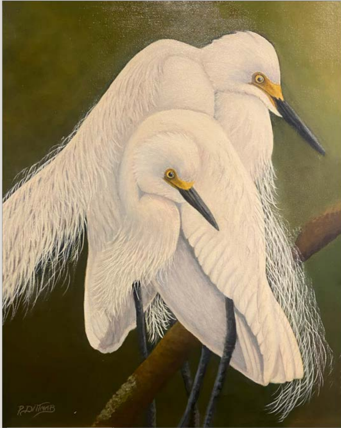
Peg Dittmar Egret Pair Oil on canvas 16" x 20"