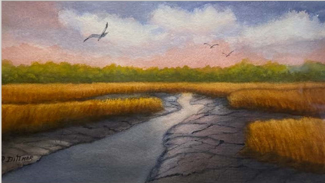
Peg Dittmar View of the Marsh Watercolor on paper 16" x 20"