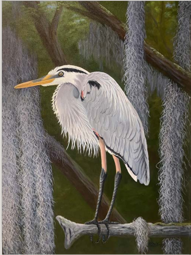
Peg Dittmar Out on a Limb Oil on canvas 20" x 24"