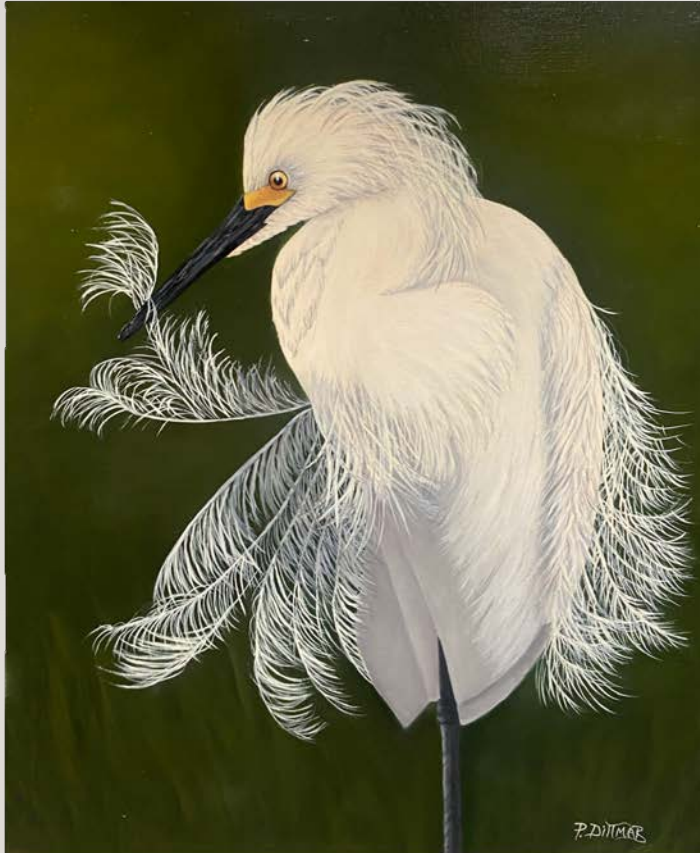
Peg Dittmar Snowy Egret in Breeding Plumage Oil on canvas 16" x 20"