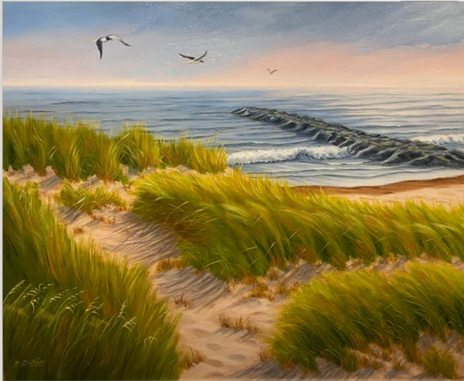
Peg Dittmar View from the Dunes Oil on canvas 20" x 24"