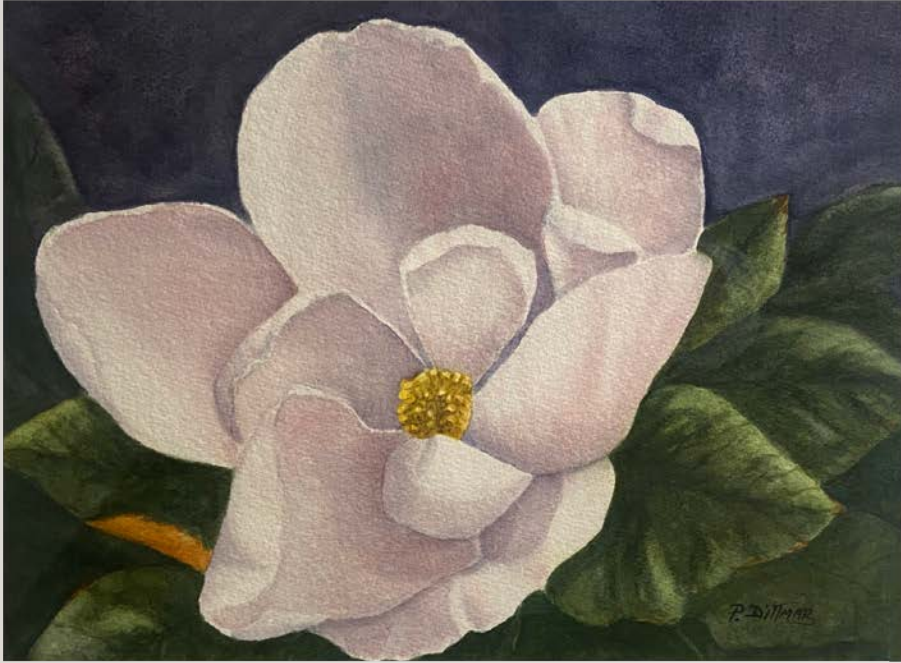
Peg Dittmar Magnolia Grandiflora Watercolor on paper 16" x 20"