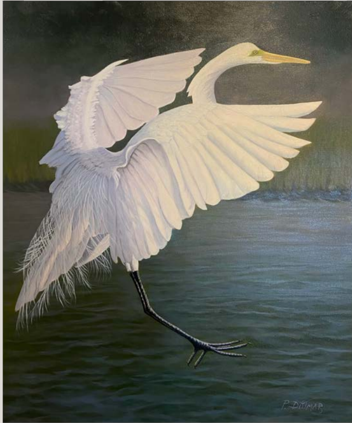
Peg Dittmar Spread Your Wings and Fly Oil on canvas 20" x 24"