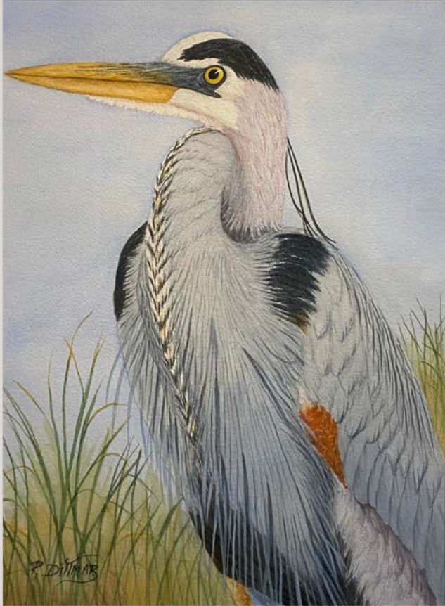
Peg Dittmar Majestic Great Blue Watercolor on paper 20" x 24"