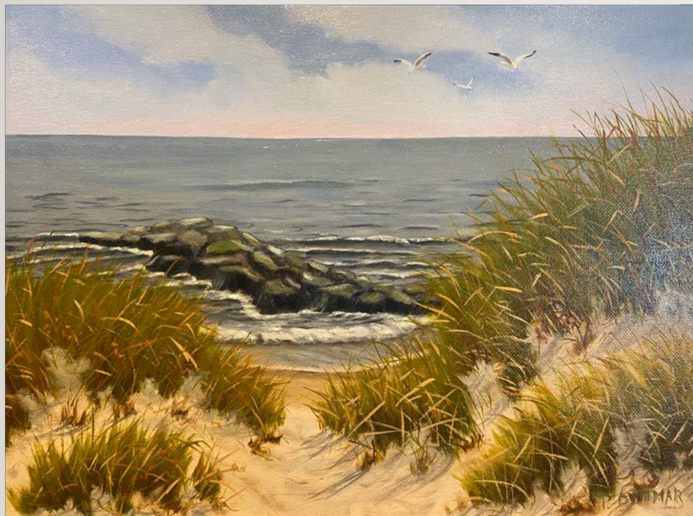
Peg Dittmar The Jetty Oil on canvas 11" x 14"