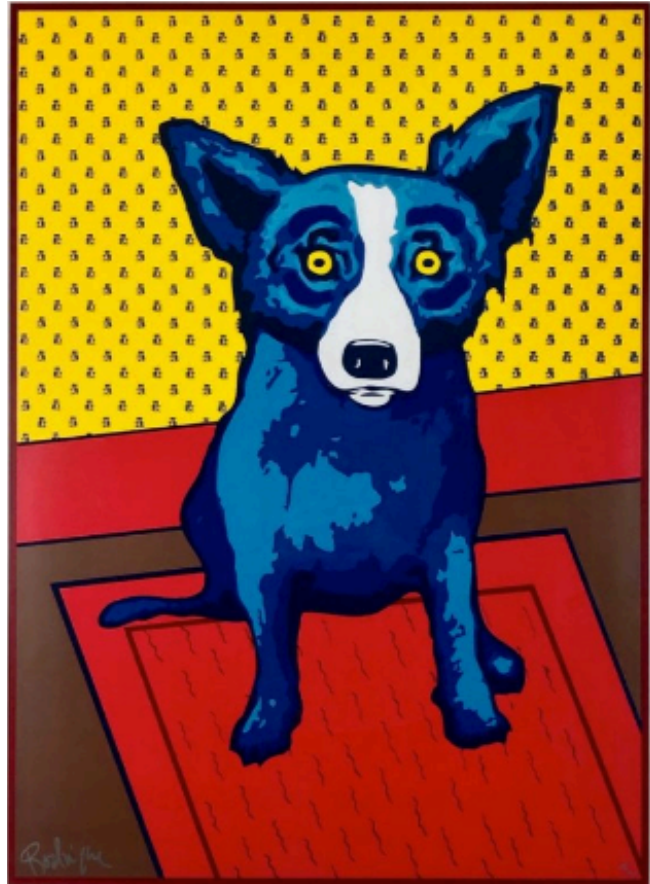
George Rodrigue, Bear Walls , 1997, acrylic on canvas