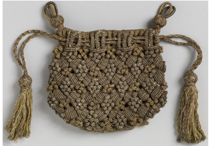
Macrame Purse , (England), early 17th century; metallic yarns Museum purchase from Au Panier Fleuri, McNeil, and General Acquisitions Endowment Funds; 1989-30-1 Collection of Cooper Hewitt http://cprhw.tt/o/2DuQz/