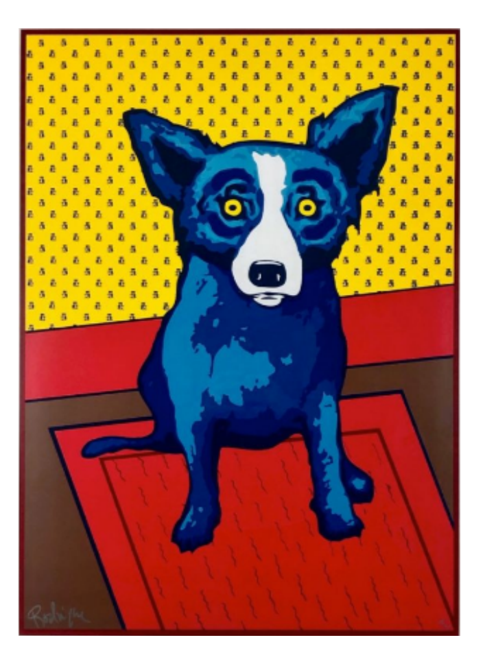
George Rodrigue, Bear Walls , 1997, acrylic on canvas

Canvas, canvas board or mixed-media paper Acrylic paint or tempera paint Paint brushes Pencil